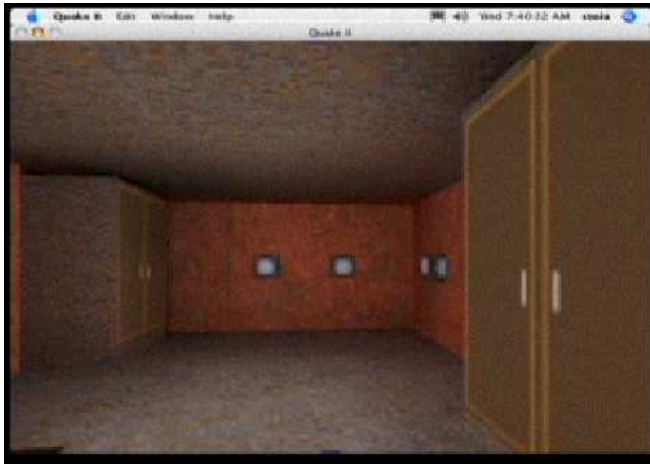
DF view of the virtual world, displayed on the DG's monitor